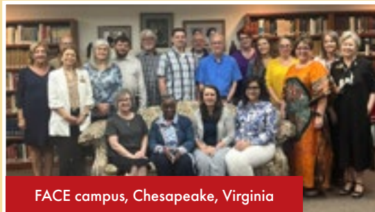
FACE campus, Chesapeake, Virginia