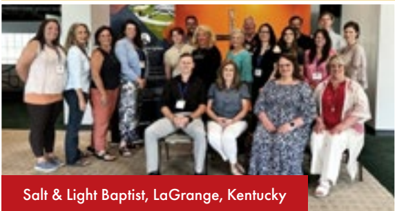
Salt & Light Baptist, LaGrange, Kentucky